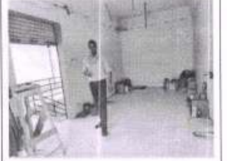
PHOTO OF THE PROPERTY